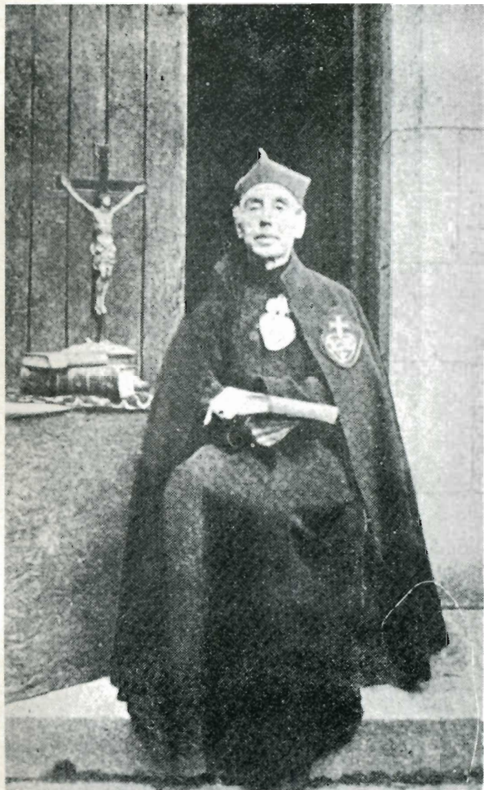
Blessed Charles of Mount Argus