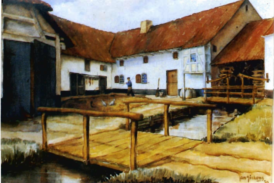
Birthplace of Fr. Charles. Notice two millwheels

next-door neighbours. Only a small garden separated their two homes. Both families were small farmers, with mills as an extra source of income. The Houben family had a flour mill and the Luytens an oil press. One and the same river provided the power to turn the wheels of both mills. If there had been matchmakers around, such as are commonly spoken of in Ireland, the prospects of a more viable holding under one management would have been an ideal situation for the promoters of romance. But whatever the material advantages of such a union, the spiritual blessings to be hoped for from the sacramental grace of matrimony were more attractive to two young people so admirably matched in faith and devotion as Peter Joseph and Johanna Elizabeth. It was the sort of marriage we often hear described as 'made in heaven.' God blessed their marriage with eleven children, the tenth of which was still-born. Their home was in truth 'a domestic church.' Each day began with family morning prayers before they dispersed for their daily occupations. The day ended with