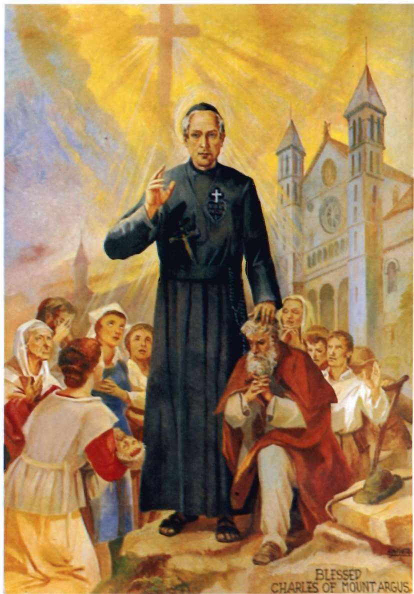
Man of faith, hope and charity. Special painting of Blessed Charles for Beatification