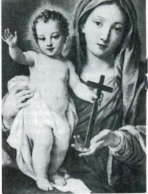
Mother of Holy Hope

greater crime of murder. This is a very human folly still practised even in our own day. Apparently David thought he had got away with it until God sent the Prophet Nathan to remind him of his sinful state and the threat of God's justice. By God's mercy David listened to the voice of conscience, admitted his guilt, accepted his penance and was reconciled with God. The Good Shepherd had found another lost sheep. Many people may be tempted to think that God's ways have changed, but it is comforting to remember that Jesus is the same yesterday and today and forever, and that even in our day God continues to converse with his chosen servants and to make them ambassadors of his mercy. United with God in a spirit of intense faith and habitual prayer Fr Charles laboured for almost thirty years at Mount Argus as an ambassador of God's mercy to the poor and suffering. From his place in heaven with the Blessed he still seeks the glory of God in the salvation of souls and we pray that the many who visit his shrine daily will always find help in their sufferings and the great peace of reconciliation with God.