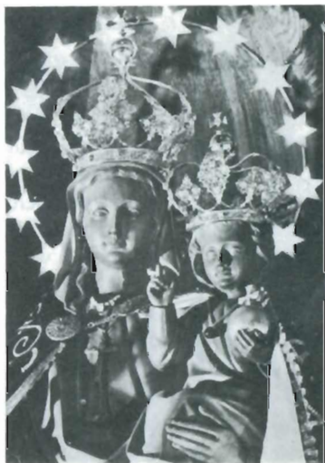
Shrine of Our Blessed Lady in the old Parish Church

Blessed Charles had a keen appreciation of this great mystery of faith. As a little boy John Andrew Houben was a gentle, affable little fellow, a favourite with everybody, always happy and content and the coveted companion of his school mates. But he didn't join them in their childhood games. Not that he had any dislike for these games of hide-and-seek, rounders, skittles, football etc. He just had found a better source of enjoyment in the company of Jesus and Mary. Quietly he turned away from the village playgrounds and headed for the village church. There he found Jesus in the Blessed Sacrament and a shrine of the Blessed Virgin Mary. In that blessed company he spent hours of silent prayer and loving adoration. St Alphonsus Liguori had written many years before that: "The soul's entire holiness and perfection lies in love of Jesus Christ, our God, our highest good, our Redeemer." Young Houben was intent on perfection.