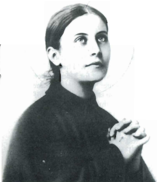
St. Gemma Galgani

of the earth have regarded and esteemed as their Mother. I would recall the words of our Holy Father, the Pope of Rome: Faithful children of the Church remember constantly those beautiful words spoken in 1870 by his Holiness Pius IX "The grand army of the Pope are the souls who pray. With this army, every obstacle will be overcome'."