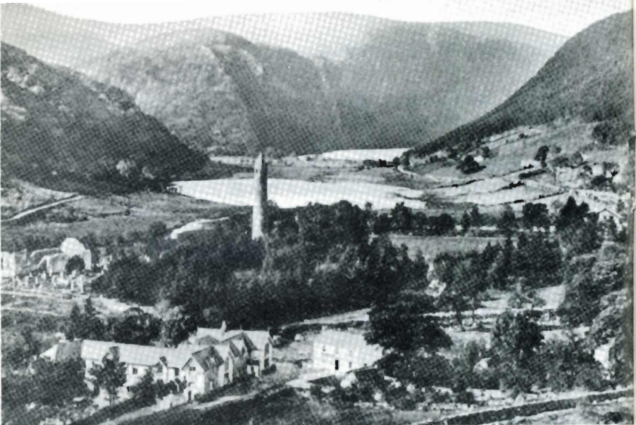
Glendalough, the City of the Seven Churches

the chronicler writes, "and sometimes sick people made the journey from Ireland hoping to be cured by his blessing." Eventually he was recalled to Dublin on January 10, 1874. The news of his return was the signal for the pilgrimage of visitors to start anew. In the annals of Mount Argus we read: "In one day, more than three hundred people came to be blessed by Fr Charles, which is the usual number of people coming to be blessed by him. Fr Charles is well known in this city of Dublin as well as throughout Ireland for the many miraculous cures people say they have received. Several persons came to Dublin from America and England for his blessing and to be cured of some disease or other."