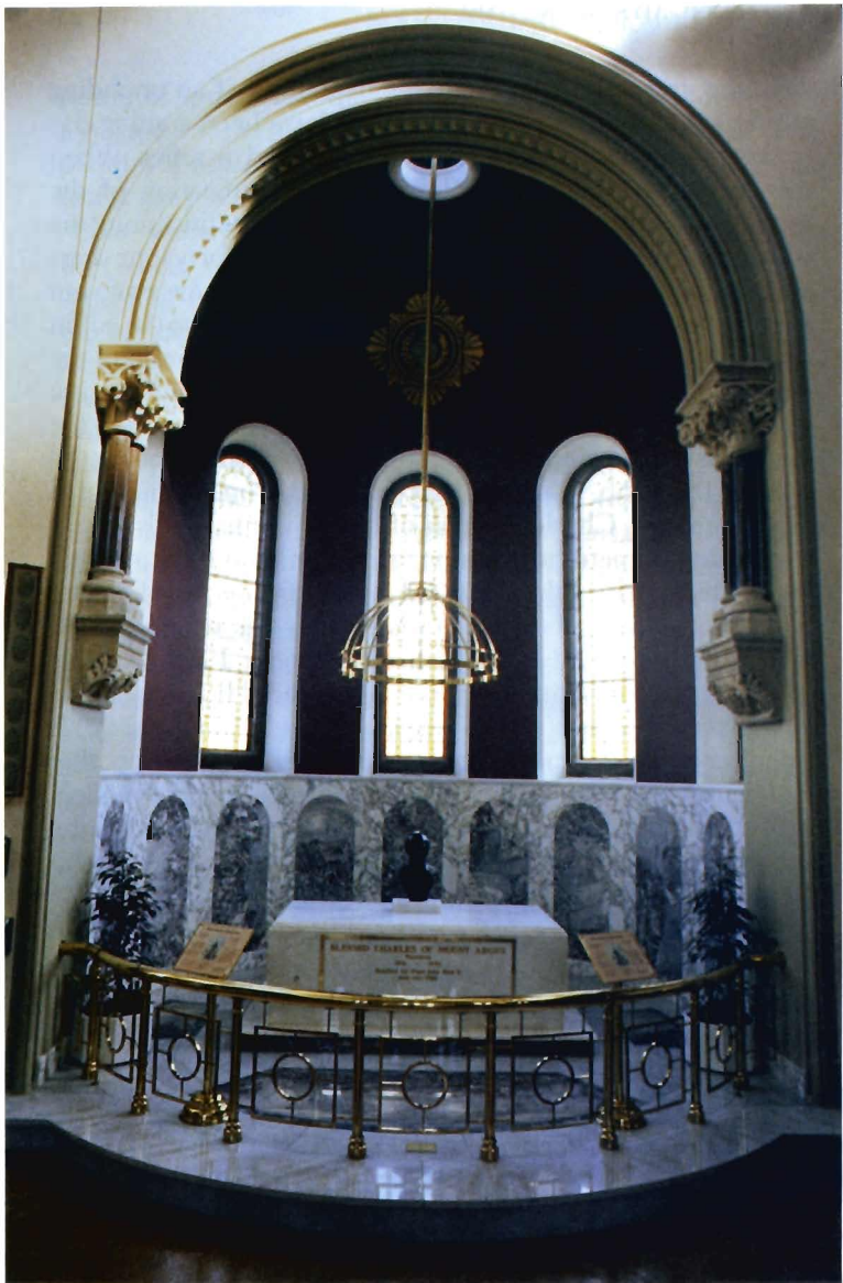
New Shrine of Blessed Charles – October 1988